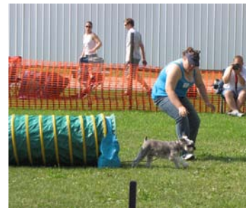
Myria and Sadie coming out of the tunnel.

Beginner trainers and dogs can do the run on leash, but the real challenge (and fun) comes when the dogs run off leash. Even the best trained dog gets distracted by the spectators and heat.