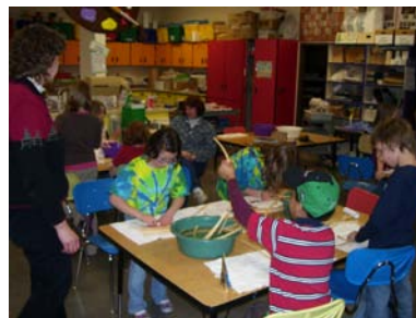
Youth in The Tomahawk Afterschool 4-H Club work intently weaving baskets.