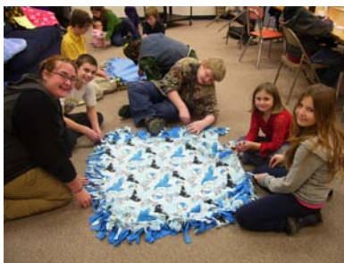
Prairie River Middle School 4-H Club Afterschool members work on tie blankets to be donated to HAVEN

4-H will continue to offered at the after school programs again starting this fall. Information will be available through the After the Bell program at Prairie River Middle School, through the Washington Enrichment Program at Washington Elementary School and in the parent packets at Tomahawk School. If a child is already a member of a community 4-H club, they may also enroll in this 4-H after school club to have more 4-H opportunities.