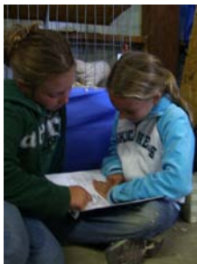
Studying for Poultry Showmanship at the Lincoln County Fair.

In the morning, we went to check on my chickens and find out exactly what time the showmanship class was taking place. I was nervous because I didn't really know what to expect. I found out that I was supposed to have a long sleeve white jacket and closed toe shoes. So I guess my t-shirt and flip-flops weren't going to work. My grandma had an idea. She remembered passing a Good Will store on the way to the show. She thought maybe we could find something there that would work.