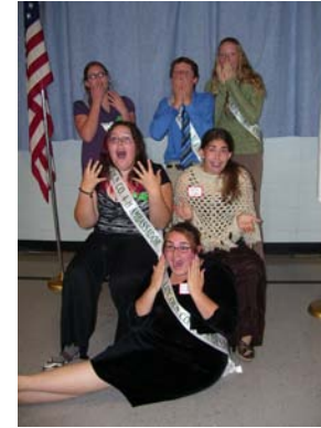
2008 – 2009 Ambassadors

For more information and an application form, contact the UW-Extension Office. Applications are due to the UW-Extension Office by September 8 th . Interviews will take place at the September 23 rd Board of Director's Meeting. All applications will receive a letter, along with an interview schedule. Returning Ambassadors may or may not be interviewed. New Ambassador duties will begin in October 2009 through October 2010.